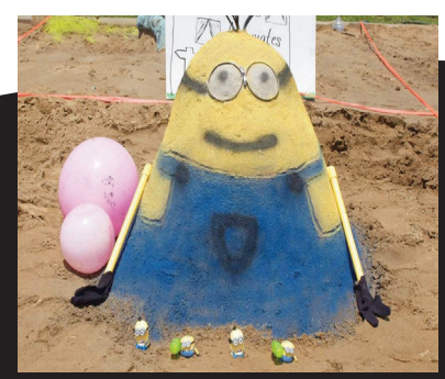
Team Maidenberg Associates - 2013