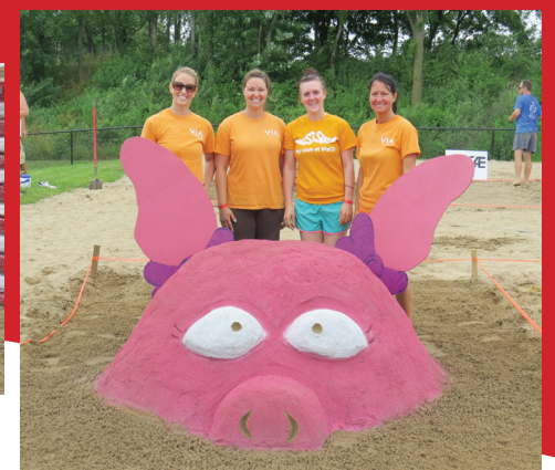
Team Riverside Credit Union - 2015