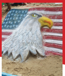
Team Oak Hill - 2012