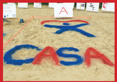
Team Atlas Foundry - 2015