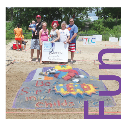
ut - Be A Super Hero am Riverside with Team