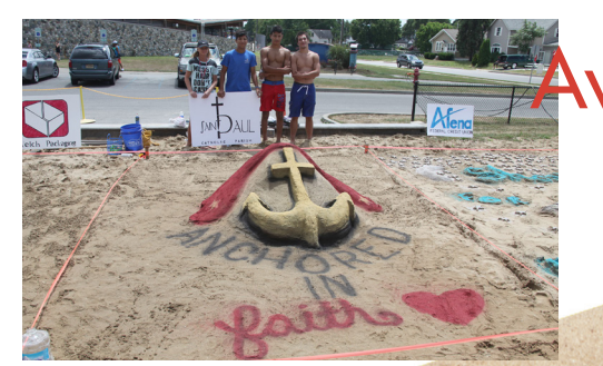
Anchored in Faith -St. Paul with Team