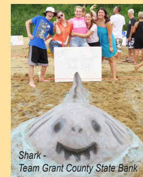
Shark - Team Grant County State Bank

Yes , we'd like to be a Corporate Sponsor at $500. Please find enclosed check.