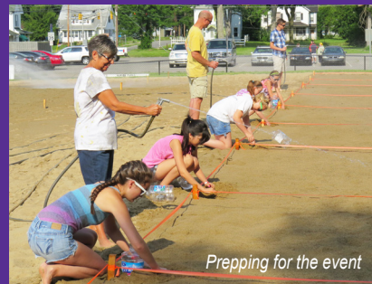
Prepping for the event