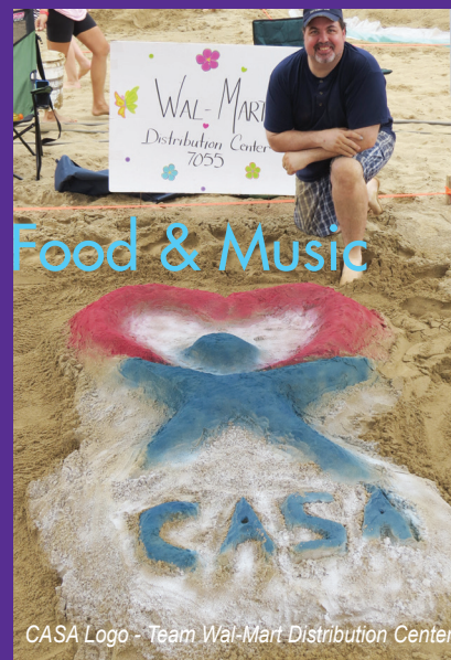
CASA Logo - Team Wal-Mart Distribution Center