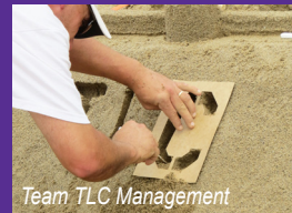
Team TLC Management